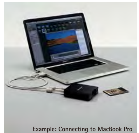
Example: Connecting to MacBook Pro

* The 30 MB/s transfer rate is the maximum rate. The actual transfer rate may be lower due to various factors, such as the file being transferred, the performance of the system (computer/OS) used, the application software and the P2 card version.