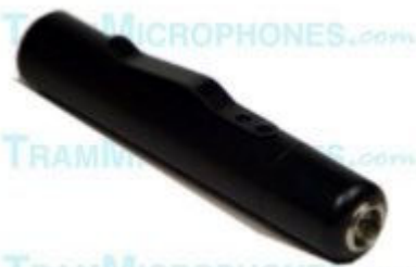
TR79ML Detachable Power Supply With TB5M Connector For Use With TRAM TR50 Mics Wired For Lectrosonics

Positive bias, operates on internal battery or external 12-