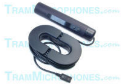
TR79 Power Supply Hard-Wired To TRAM TR50B Lavalier Mic

Connection between the TR50 and TR79 is through a connector of choice (from an extensive list), matching the connector used by an accompanying wireless transmitter if required.